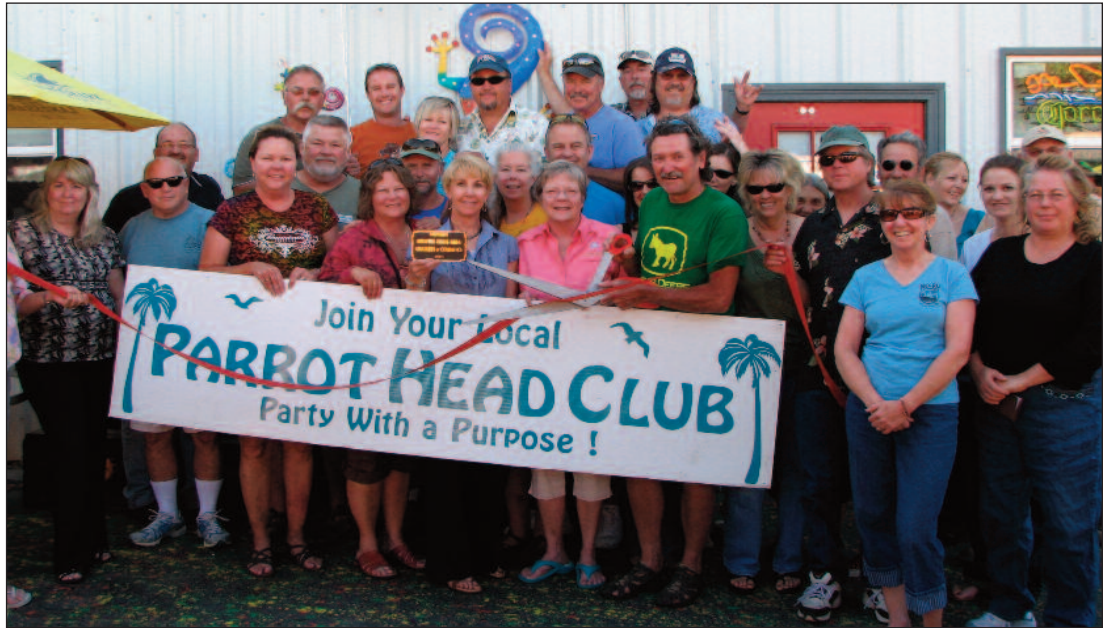
chamber photo The Craig Chamber of Commerce welcomes the Northwest Colorado Parrot Head Club , a non-profit dedicated to preserving and enhancing the environment and the local community. They provide social interaction among people interested in the lifestyle and music of Jimmy Buffett and who love life in the Rocky Mountains. Call (970) 824-7410 for more information or to join.