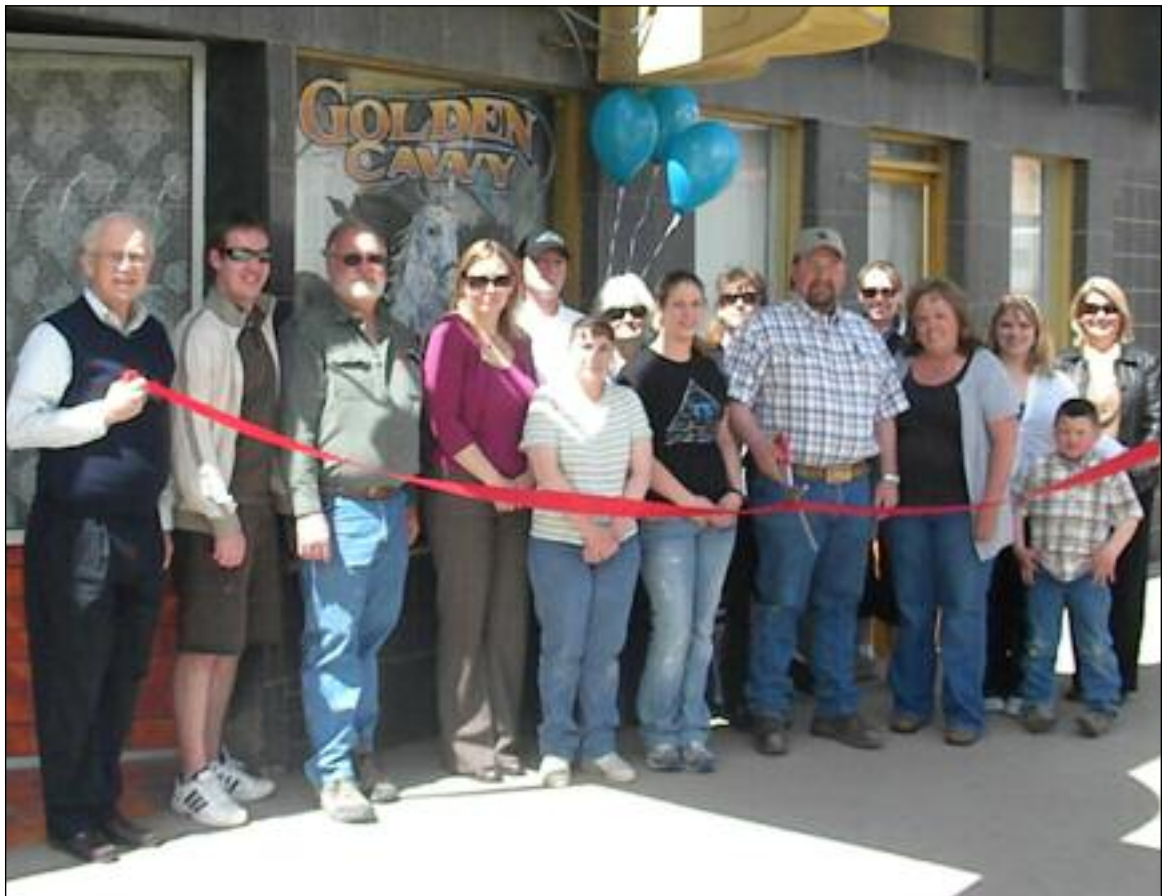
CHAMBER OF COMMERCE PICTURE